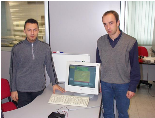
Fig. 2 The Logis Srl control centre and technicians

The control centre is based on a personal computer, which is connected to all the control units through a GSM