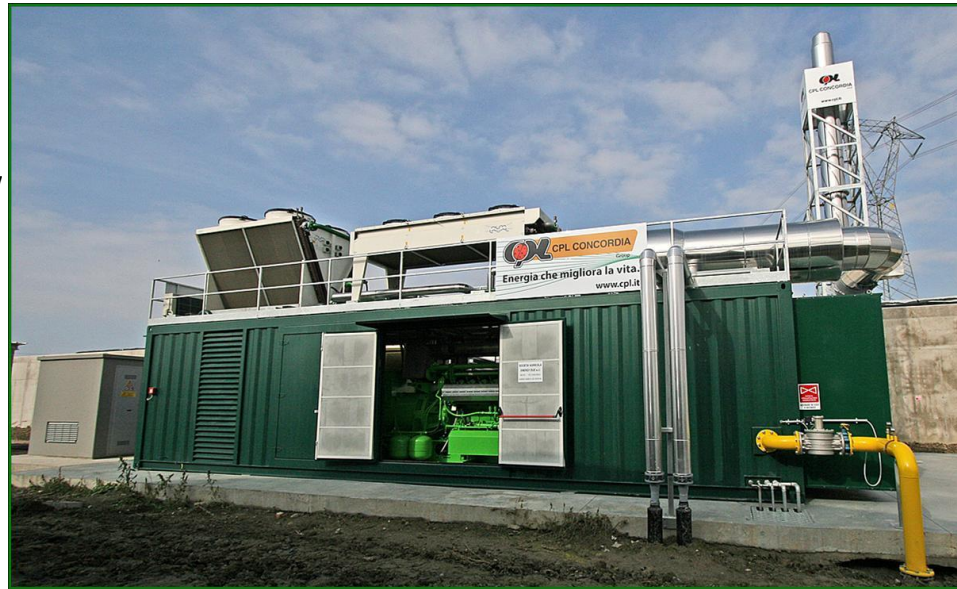
One of the 4 Jenbacher motors, situated in a container purposely designed to house all the process components needed for efficient system management.