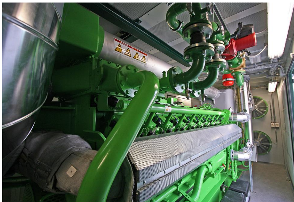
The four cogeneration motors are injected with the gas produced by the biomass to produce a total of 4 Mwe of electric power with zero CO2 emissions.

The main objectives were to protect the environment and stimulate agricultural