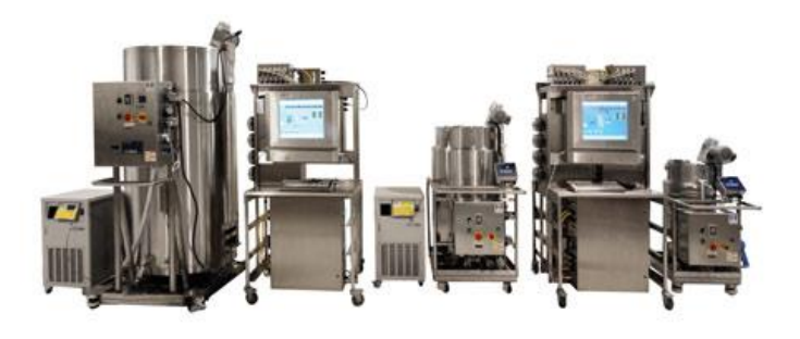
Finesse Bioreactor Controllers for Lab and Production Use

Bioreactors are designed to deliver the optimum growth environment for cells or bacteria. They deliver the environment used in the biotechnological production of substances such as replacement cells, pharmaceuticals, antibodies, or vaccines. This production requires a tightly controlled combination of temperature, pH, dissolved oxygen and pressure. Creating the ideal environment requires the right agitation to create a homogeneous growing medium. This environment is the ideal place for all growth, both desired and unwanted, hence cleanliness is a key factor. Many bioreactors today offer single use components, sterile replaceable bag chambers and single use sensors – all of which are the forte of Finesse.