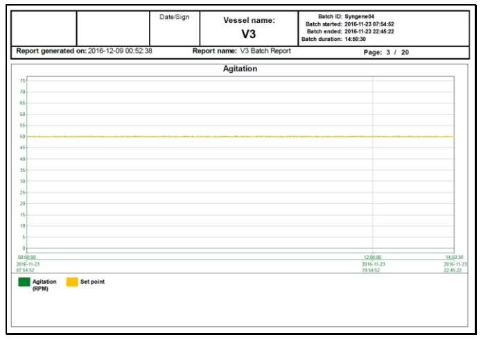
Bioreactor Agitation Control